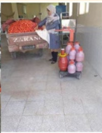
AAWA funded projects in Herat, Afghanistan